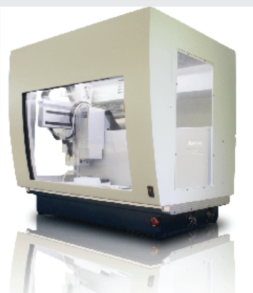
Figure 2 : VERSA 1100 Workstation (L 93cm x W 62cm x H 62cm)