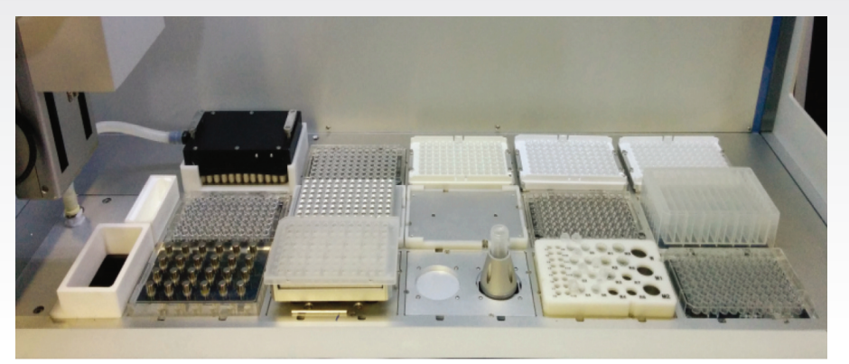
Figure 3: The deck layout of VERSA 1100 Workstation