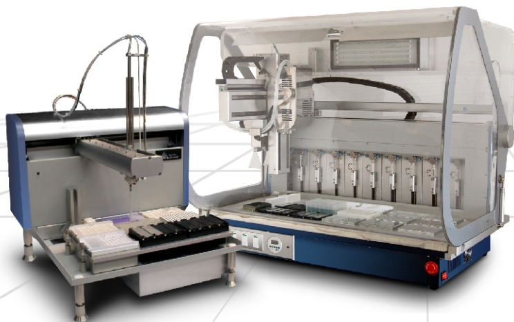
VERSA 1100 Workstation